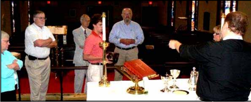
At the Eucharistic Minister training on June 7, 2009