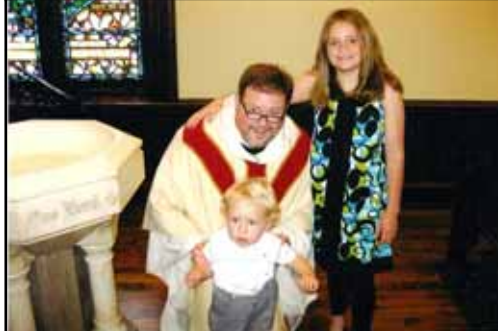
Baptisms on Pentecost and the 2nd Sunday after Pentecost -