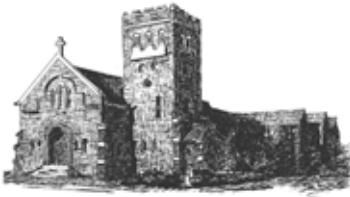
Celebrating 175 years