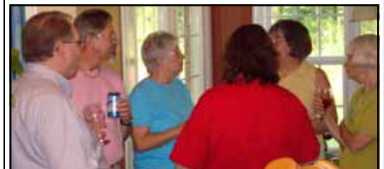
Choir members at the Choir party on July 1.

Amos 6:1-7 • Psalm 146 • 1 Timothy 6:19-31 • Luke 16:19-31